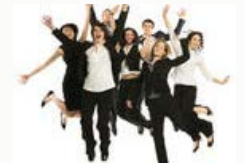
We Made the List