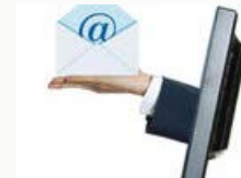
I Reach, E Reach