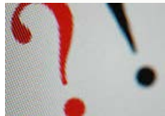
You Ask, We Answer