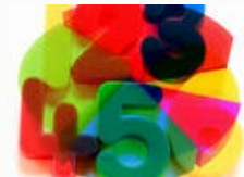
By the Numbers